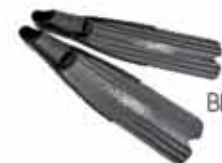
LONG BLADE FINS