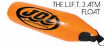
THE L.I.F.T. 3 ATM FLOAT