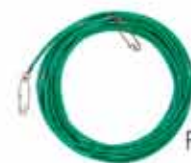
SEAVINE II FLOATLINE